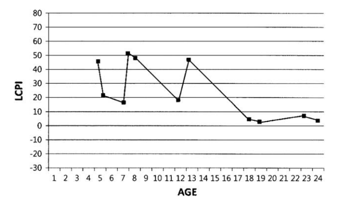
Figure 3 Graph of the difference in reduction between the mean postoperative lateral condylar prominence index (LCPI) and LCPI at final follow-up for the corrected elbow. The difference in LCPI reduction was greater in the prepubertal group than in the post-pubertal group (P = .006).

varus deformity, 1 had inadequate intraoperative correction of varus deformity, and 1 had spontaneous recurrence of varus deformity after adequate correction. Table I details patient demographics.